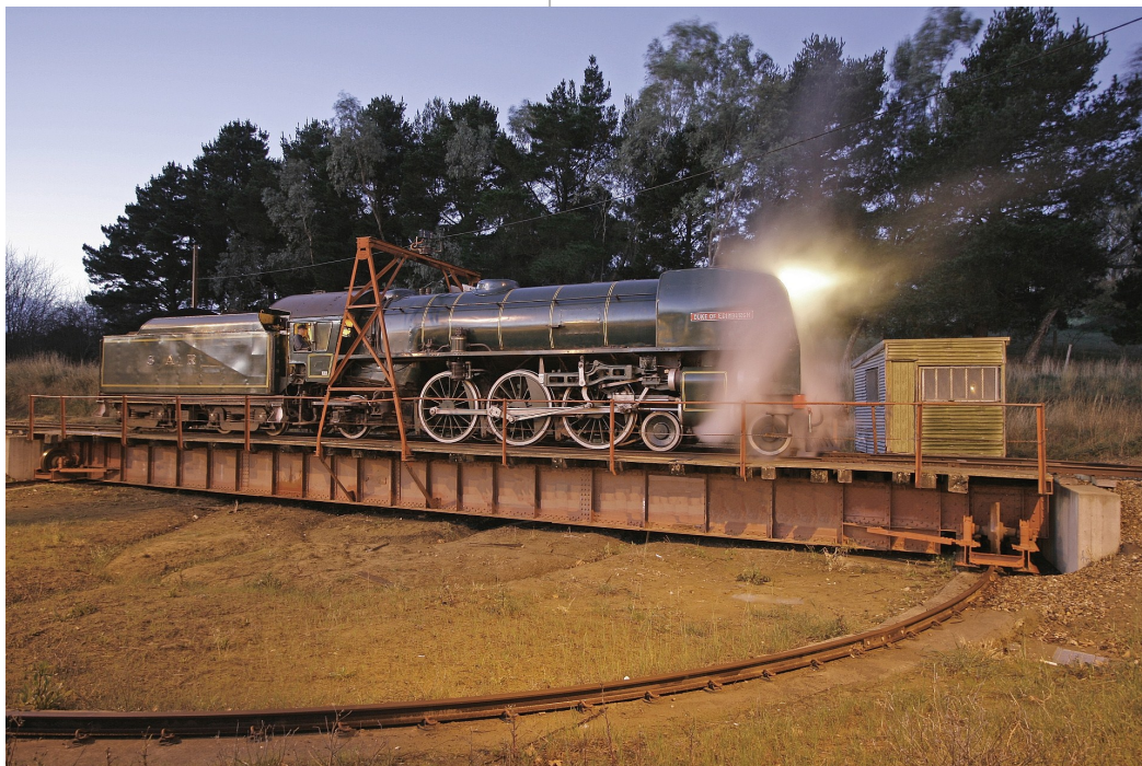
Below - a typical example of a Railway turntable in action