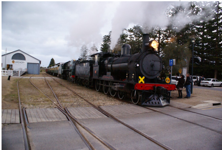
Left - Steamranger at the Goolwa Station - 'Steamfest 2012'

In the longer term, it is proposed to construct a dead-end siding track on the north-western side of the existing station platform which will permit a railcar to take on passengers for trips to Strathalbyn and Currency Creek, at the same time as the Victor Harbor train is in the station. In addition, the pedestrian crossing to the Brewery will be fitted with the last remaining 'wig-wag' warning bell and sign in South Australia as a novelty attraction.